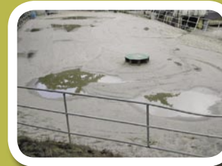
» BEFORE: Very muddy arena