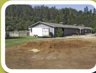
» BEFORE: Manure stored on the ground